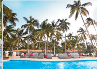
SELECT AT GRAND PARADISE SAMANÁ

WE ARE THE LARGEST "GENUINELY" DOMINICAN HOTEL CHAIN THAT MANAGES RESORTS ACROSS THE COUNTRY UNDER THE ALL INCLUSIVE CONCEPT SINCE MAY 2000.