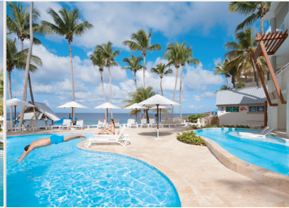
SELECT AT CASA MARINA