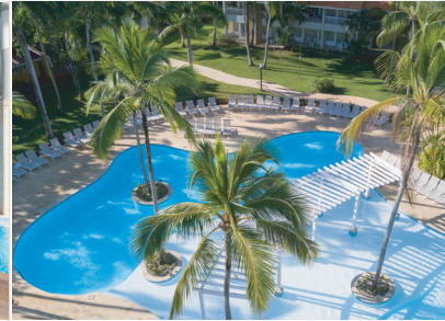
GRAND PARADISE SAMANÁ