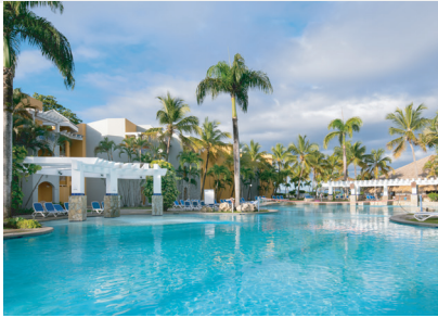
CASA MARINA BEACH & REEF